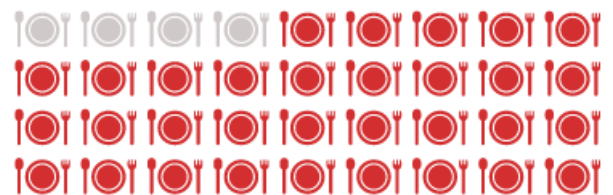
People fed throughout the year

"Be steadfast and firm in the way towards what is right, even if your journey is full of pain and challenges"