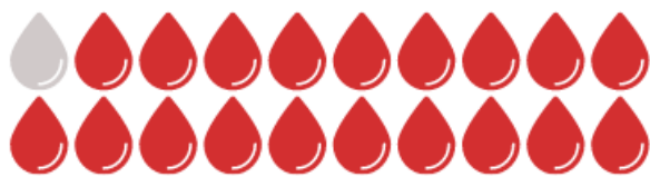
lives saved through 37,855 blood donations