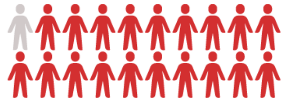
Beneficiaries through acts of kindness, helping the vulnerable, and community building.